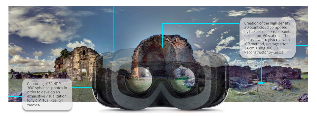
Figure 1. Virtual experience mock-up: by the use of a head-mounted display the Geguti Palace will be explored and information on the 3D survey will be accessed.

In particular, this paper will stress the VR issue focusing [Figure 1] on several hardware devices and software platforms for digital content management. This case study will contribute to the analysis of further exploitations of Virtual Experiences for the Cultural Heritage field.