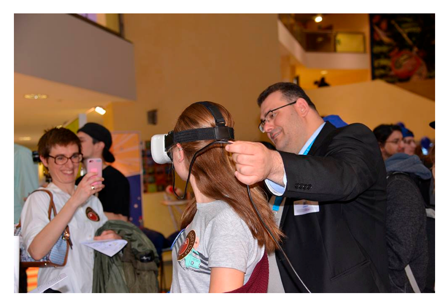
Figure 4. The content was presented during the Europe Day 2017 in Brussels. The event has been used as test and verification field for the immersion capabilities of the systems presented above, due to the availability of large and differentiated audience of families with young children.

During the Europe Day 2017 initiative, the presented VR systems have been tested on over 200 people of different ages [Figure 4], enabling us to test both the immersive VR technology and the ease of use of the devices. Most of the time, users were able to easily enjoy the VR experience. From the very first seconds, users were already moving freely into the virtual space, even looking for an interaction with this. It was deeply impressing the immersive experience of pre-school children, who often needed compare the reality with the virtual environment.