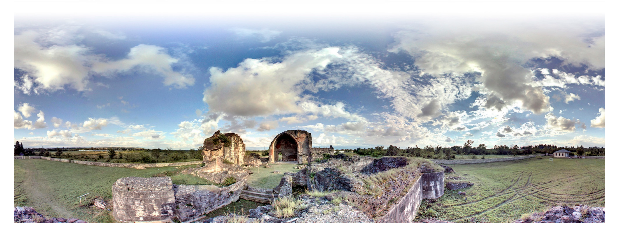
Figure 2. During summer 2016, 30 HDR 360° spherical photos have been taken in order to develop an exhaustive visualization for VR (Virtual Reality) viewers.