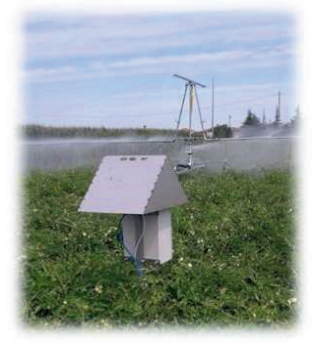
Fig. 1. Portable sensing unit in tomato field during sprinkling irrigation.

respectively. After a lab-calibration, we selected 8 MOX gas sensors to integrate in the two dedicated hardware (see Fig.1), each consisting of: a double protection and compact size outdoor box, 4 aluminum test cells for direct flux exposure, humidity/temperature sensors, a firmware for the real-time signal acquisition, the remote management of the measuring system, storage, data transmission, setting of the operating parameters.