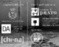
2: Macrolotto 0 Hybrid Hutong, Exhibition of Labs projects, Prato, February 2015