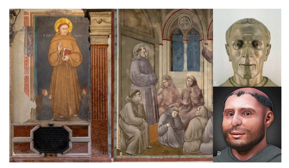
Fig 1. The representation of St Anthony. (A) St Anthony giving his blessing, Giotto School. This portrait is considered to reflect the true effigy of the Saint. Padova, Basilica del Santo (1238–1310), Giovanni Pinton/ Archivio Fotografico Messaggero di Sant'Antonio, 2020. (B) Giotto, St Francis appears in the Chapter of Arles, ca. 1295–1299. Assisi, Chiesa Superiore of Basilica di San Francesco. In the detail, St Anthony is illustrated suffering, with a bloated abdomen. (C) Bust of St Anthony, detail. Bronze sculpture by Roberto Cremesini, 1995. This is a scientific reconstruction of the 'real' face of the Saint, based on the skull found after the recognition of his body in 1981. In the reproduction of this bust, the artist relied on the advice of three scholars: C. Corrain (anthropologist), V. Meneghelli (anatomist) and V. Terribile Wiel Marin (anatomopathologist). Photo by Giorgio Deganello/ Archivio Fotografico Messaggero di Sant'Antonio, 1995. (D) The 3D Forensic Facial Reconstruction of St Anthony of Padua. Cicero Moraes—Opera propria, CC BY 3.0, https://commons.wikimedia.org/w/index.php?curid=33660858.

https://doi.org/10.1371/journal.pone.0260505.g001