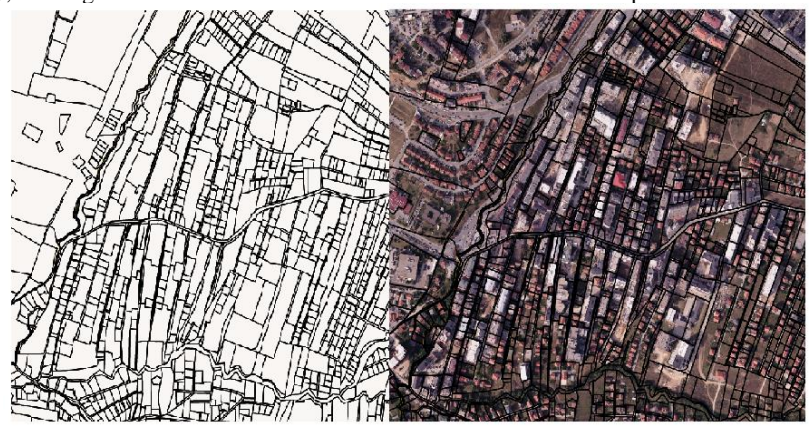
Fig The situation with land structure and urban development in suburb area "Mati 1" in year 2019

In order to implement the plan the municipal authorities have improvised the solutions which in most cases have been unproductive because in many cases haven't been in accordance with the urban plan. In other words, the planning process and the instrument used for implementation did not produce a land structure that would allow easier and rational implementation of the plan. Today, the neighborhood can be considered as a bad urbanization example.