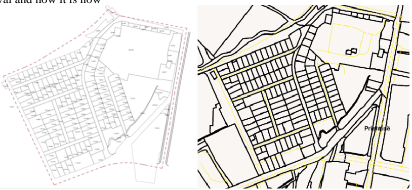
Fig. The land structure of urban area "Qyteza Pejton" before URP and now

Although the new urban plan use foresees changes to the land structure, namely the merging of parcels within the block to allow for increased housing density, this has failed to occur in almost any part of the area. The figure below shows the difference in land structure before urban plan approval and how it is now