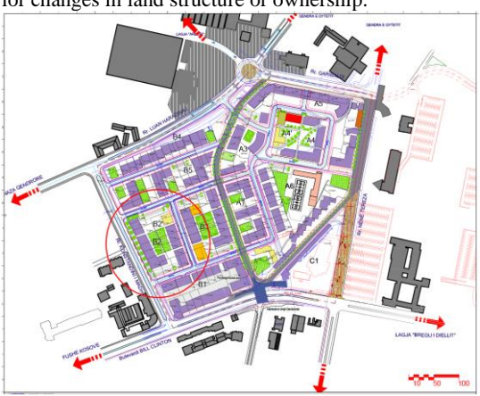
URP "Qyteza Pejton" Pristina

The first case study is concerning the urban redevelopment of the urban area "Qyteza Pejton" in city of Prishtina. According to "Urban Strategic Development Plan of Prishtina 2004-2020" (USDPP), the area has been defined as one of the key areas for urban redevelopment. The purpose of drafting the Urban Regulatory Plan (URP) for this area has been the creation of legal conditions for the redevelopment of the area as one of the central city zones. The plan has been initiated by the municipal authorities. The neighborhood was initially built as a residential area mainly for individual housing units. New urban regulations set by the municipality through the URP enables the density increase of the area. Inside the area covered with urban plane there are some of public facilities such as the primary school. Other public facilities are planned to be constructed in private owned land. However, the new urban land plan has been approved by municipality assembly without prior changes in land structure or ownership.