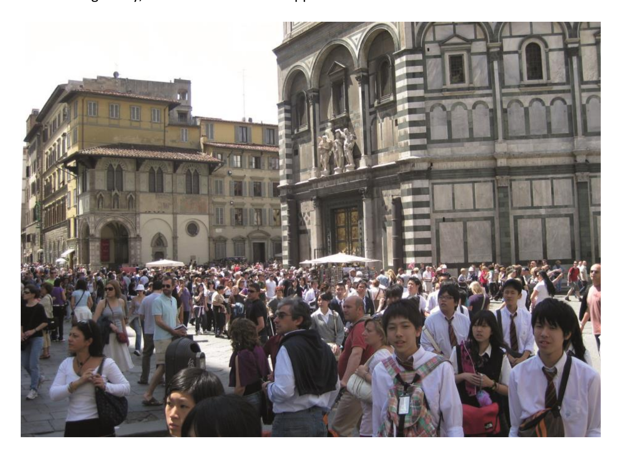
Figure 1. Tourists in Piazza San Giovanni

What visibility was Florence looking for? or rather what visibility did it need? If indeed Sheki or Baguito City they can express their artisan identity even with just an image but they are not known globally, for Florence the exact opposite was true.