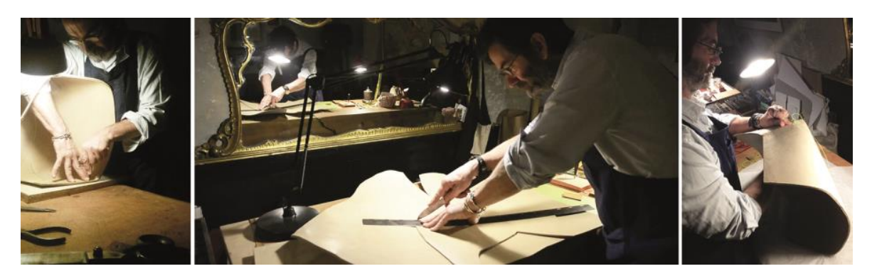
Figure 2. leather craftsman at work

Simon Anholt, an expert in places and perception, argues in Places: Identity, Image and Reputation, that public opinion very often tends to be superficial and therefore to work by cliché, by stereotypes. The image that others perceive is often quickly transformed into what is defined as "reputation". And reputation is about identity and values. It is therefore necessary to start behaving and acting in order to be able to influence the way in which one is perceived, as Socrate argued stating that «The best way to earn a better reputation is to strive to be what you want to appear»