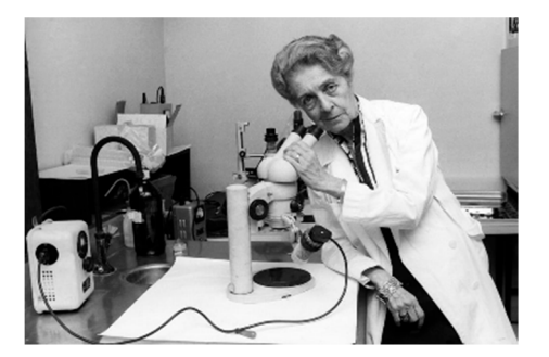
Figure 2. Rita Levi Montalcini (Nobel Prize in 1986 for Nerve Growth Factor discovery).

OXERVATE<sup>®</sup> case study. Oxervate (brand name of cenegermin eye drops solution) has been recently approved in Europe and US with indication in moderate and severe neurotrophic keratitis (NK). Cenegermin is the INN name of rh-Nerve Growth Factor (rhNGF), a protein (neurotophin) discovered by Rita Levi Montalcini (Figure 2). NGF is a naturally occurring protein in humans involved in differentiation, growth, maintenance and survival of neurons.