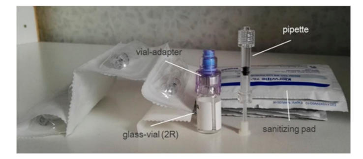
Figure 3. Oxervate<sup>®</sup> administration kit.

Current drug product primary packaging. The product is currently packaged into a siliconized clear glass class-I vial closed with a rubber stopper and a flip-off aluminum cap (Figure 3). Each vial contains 1.0 mL of the product. The ocular administration of the drug product is achieved by means of a plastic vial adapter positioned on the stopper head to which a polycarbonate pipette (with a capacity of 120 mcl) is connected in order to withdraw the solution and deliver a drop of liquid into the eye. Six administrations per day from a single vial and using 6 pipettes are carried out (daily multidose vial).