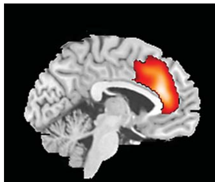
Fig. 3. T1-weighted magnetic resonance superimposition of the CG data presented in table 2. Comparisons between 18 F-FDG uptake in O65 CG subjects (n = 36) and that in U65 CG subjects (n = 22) showing a reduction in cortical glucose consumption in the left anterior cingulate cortex in O65 as compared to U65 subjects.

In the 'cluster level' section on the left, the number of voxels, the corrected p value of significance and the cortical region where the voxel is found are all reported for each significant cluster. In the 'voxel level' section, all of the coordinates of the correlation sites (with the Z score of the maximum correlation point), the corresponding cortical region and the BA are reported for each significant cluster. In the case that the maximum correlation is achieved outside the gray matter, the nearest gray matter (within a range of 5 mm) is indicated with the corresponding BA. FWE = Familywise error; FDR = false discovery rate.