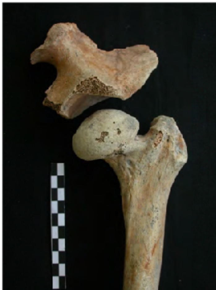
Fig. 1 Bones of left hip of individual 92 D from Spina necropolis showing pathological alteration involving both the proximal epiphysis of the femur and acetabulum.

67.3 respectively) (Table 1) and present a Poirier's facet (Angel, 1960, 1964; Kostick, 1963). The apparently lesser length of the left femoral neck (Table 1) is mostly due to the posterior flattening of the head.