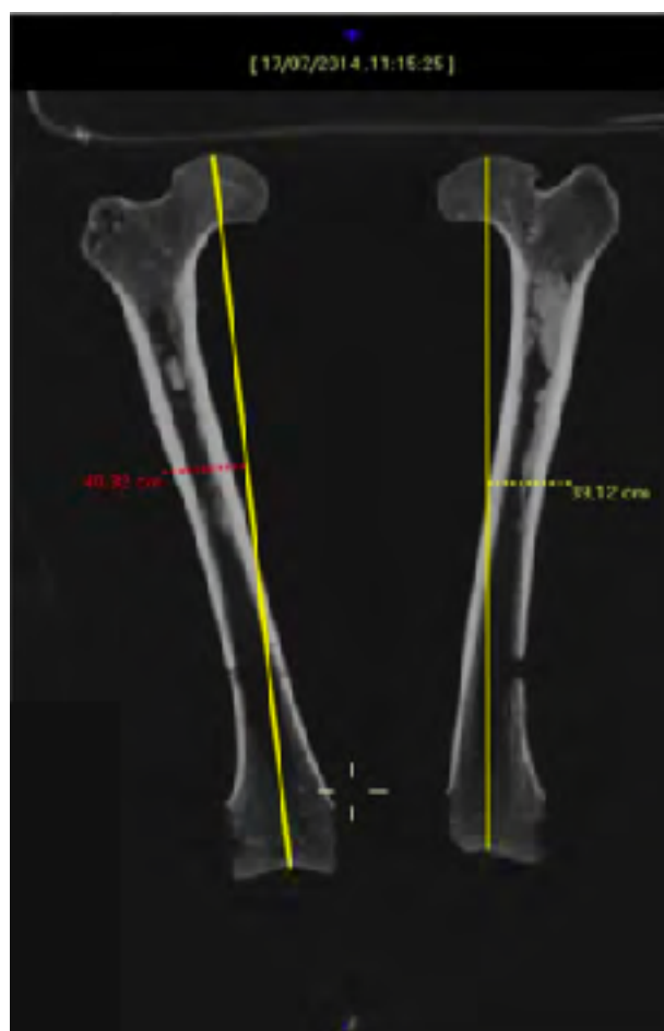
Fig. 5. Physiological length reconstruction of CT images (coronal plane) of femora with respective cranio-caudal lengths.

epiphyseal dysplasia, as they usually involve both hips or other joints (Anderson et al., 2010; Harris, 1986; Rosenfeld et al., 2007; Ruosi et al., 2003).