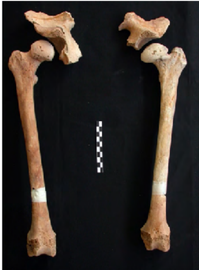
Fig. 2. Comparison between bones of both the left and right hip of the analysed individual. It is possible to appreciate that the pathology is uni-lateral and involves only the left hip.

capitis (the insertion of the ligamentum capitis femoris ) and shows some porosity and exostosis on the articular surface. However, there is no evidence of severe osteoarthritis (Rogers and Waldron, 1995). The left acetabulum is markedly flattened in comparison to the right (Fig. 2) and shows an osseous border and some foci of erosion on the articular surface (Fig. 3). Unfortunately, both coxals are only partially preserved and the acetabula are not complete, preventing comparison of their diameters. No evidence of an accessory acetabulum is present in the fragmentary coxal bone. The collo-diaphyseal angle is above 120^\circ on the right and below 120^\circ on