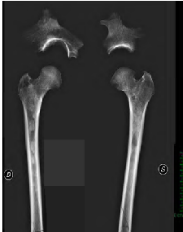
Fig. 4. Anterior-posterior X-ray of both femora and respective fragmented acetabula in anatomic position.

of mild osteoarthritis is present on the left femoral head (porosity and exostosis on the articular surface) (Rogers and Waldron, 1995). There is no sign of severe osteoarthritis. The marked flattening and osteoarthritic modification of the left acetabulum in comparison to the right was also confirmed.