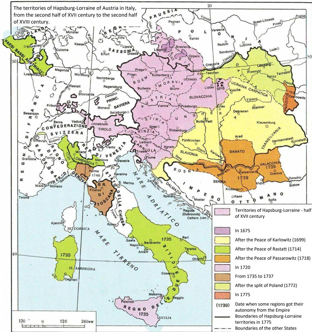
Figure 1 - Hapsburg-Lorraine Empire and Grand Duchy of Tuscany