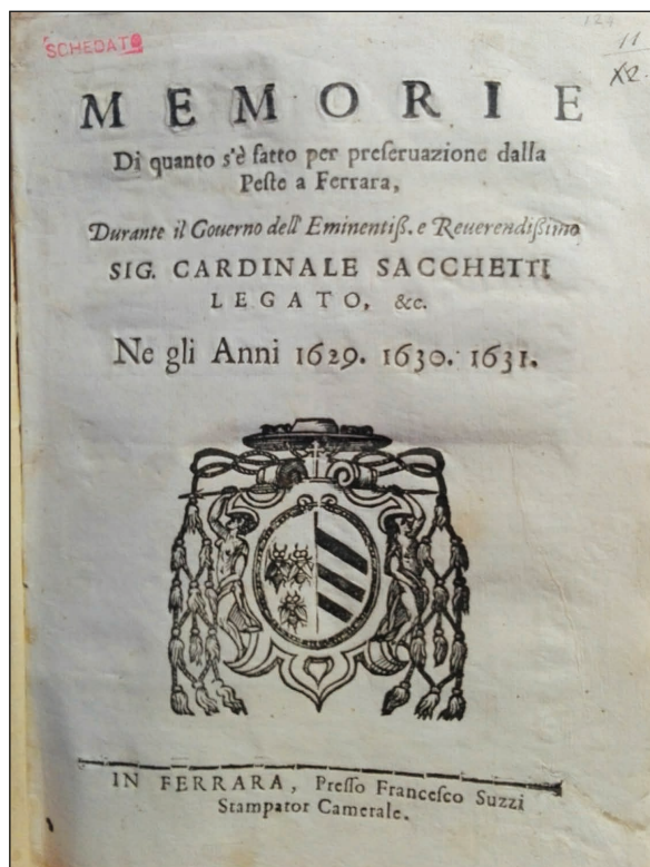
Figure 4 - Memorie di quanto s'è fatto per preseruazione dalla peste a Ferrara l...i ne gli anni 1629 1630 1631. Ferrara, 1632. Biblioteca Comunale Ariostea di Ferrara, MF 124.11.

At the end of the epidemic, the Authorities published a Report about what had been done to protect Ferrara from the plague in the years 1629, 1630 and 1631 ( Memorie di quanto s'è fatto per preseruazione della peste a Ferrara ... ne gli anni 1629, 1630, 1631 ) (Figure 4) [28].