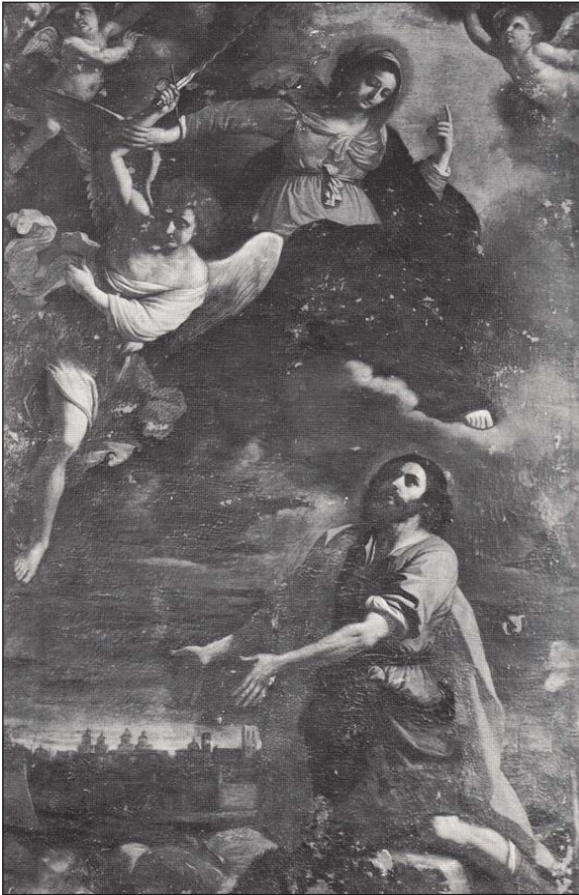
Figure 1 - Benedetto e Cesari Gennari, copy of the Guercino's work. San Rocco who implores the Virgin to free Ferrara from the plague, 1668 Pinacoteca of Ferrara.

the mortality rate in that period was 20 deaths per week [10], absolutely regular for 32,000 inhabitants (Figure 1).