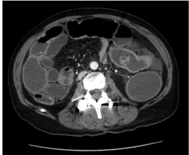
Fig. 3 - Post-STARR abdominal CT: signs of sigmoid ischemia.

Common complications are rectal bleeding, pelvic and anorectal pain, urgency and fecal incontinence. Uncommon complications are rectal perforation and pel-