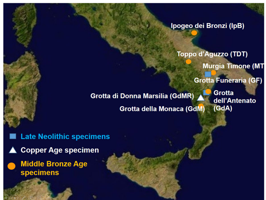
Fig. 1 The sites investigated according to the archaeological period of the sampled specimens. Two different specimens were sampled from Grotta dell’Antenato: GdA01 dated to the Late Neolithic (blue) and GdA02 dated to the Middle Bronze Age (orange)

Murgia Timone (MT) and Grotta Funeraria (GF) These two sites are located in the hilly area of Murgia (Matera), along the edges of the ravine of the Bradano river, where several burials were discovered. Information on the archaeological data and the results of our radiocarbon dating indicate a long frequentation of this area for funerary purposes. The published AMS radiocarbon date on a human skeleton from Grotta Funeraria indicates that the earliest burials probably date to the late Neolithic (GF01a: 5064–4894 cal. BCE (90.1%)). The little published information for these two sites mainly relates to Murgia Timone, where archaeological excavations carried out between 1800 and 1900 discovered three graves (Quagliati 1896; Patroni 1897; Ridola 1901, 1912; Grifoni Cremonesi 1976; Lo Porto 1988; Tunzi Sisto 1999; Matarese 2014). For the purpose of our study, we have only