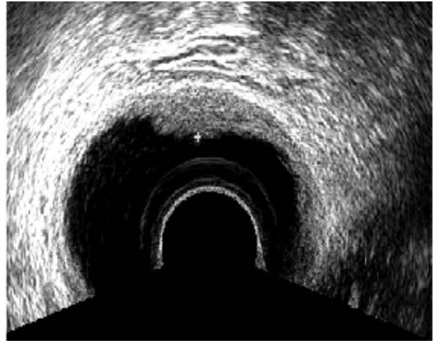
Figure 2. — Ultrasound image of a rectovaginal endometriosis lesion appearing as a plaque with well-defined margins.