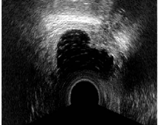
Figure 4. — Ultrasound image of rectovaginal endometriosis with mixed aspect.

who previously had sex, having to be performed using the transvaginal probe. The technique consists in introducing through a single-path catheter into the vaginal cavity 250-500 ml of physiological solution following the positioning of the ultrasound probe.