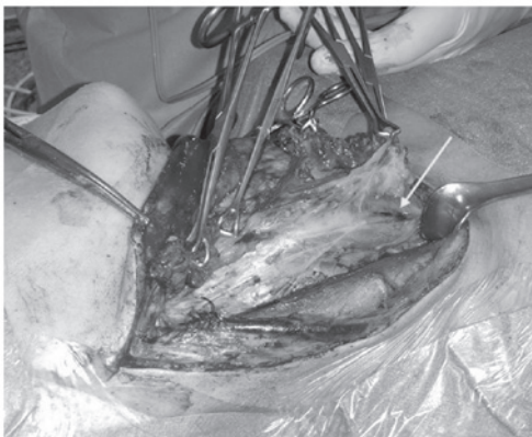
Figure 3. Accumulation of charcoal near the level IV node and in the previous needle path providing the direction to follow during dissection. The arrow indicates the charcoal trace created during needle extraction.

was found associated with parathyroid cyst (no. 6) and finally the suspected lesion, which is of small dimension (3 x 5 mm), were not confirmed at histological examination, even if a group of 3 nodes were removed (no. 20).