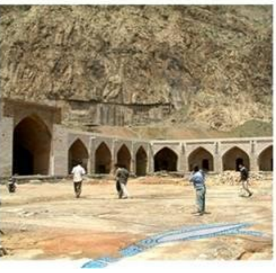
Fig. 1:BISOTUN historical landscape. (Author)