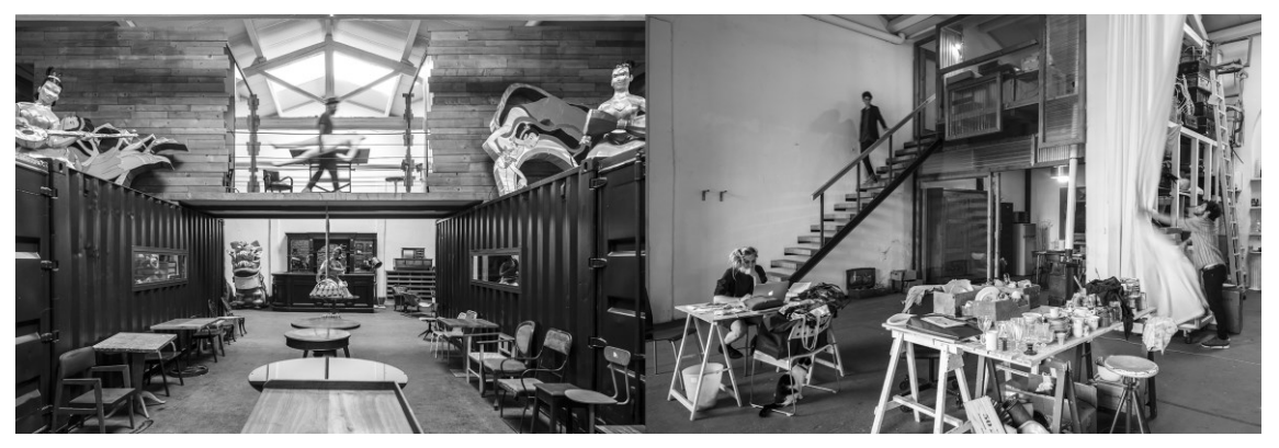
Figure 5. Corte Genova, craft buildings enhanced by artists using "waste" elements found in different spaces, Prato.