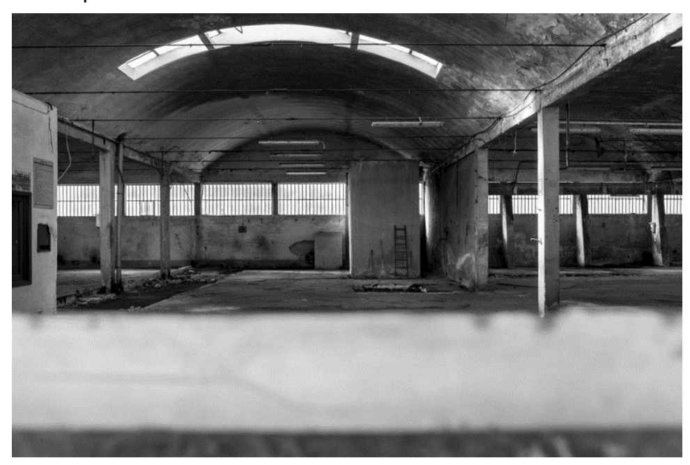
Figure 2. Typical neglected industrial building in Marcolotto 0, Prato.

This experiment can only be possible in Prato, the city of carded wool. This fabric born from the "scrap" of clothes represents the engine of the economic regeneration process of the area.