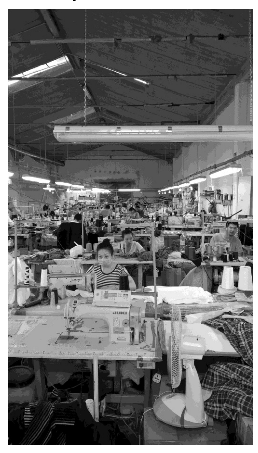
Figure 1. Fashion factory of the Chinese mono-ethnicity inside an industrial building with total lack of hygienic regulations.

Like many medium-sized Italian cities, Prato underwent a substantial change of aim and perspective during the end of the last century, going from a city-factory, characterized by textile and fashion production, to a multiethnic center forced to face the Chinese mono-ethnicity immigration. Disused and incomplete sections of the city have started to appear due to the recent economic crisis followed by widespread social unsustainability: The Macro Area 0 is one of these realities.