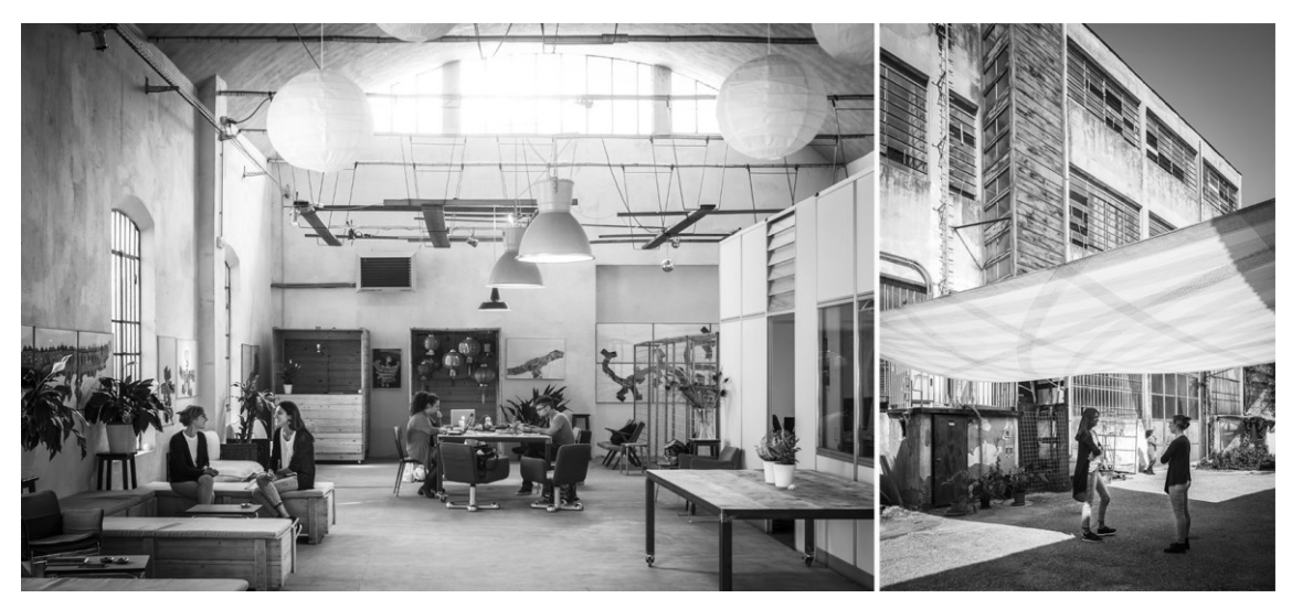
Figure 4. Neglected industrial space temporarily used by the Chi-na Cultural Association as a venue for exhibitions, events and co-working.