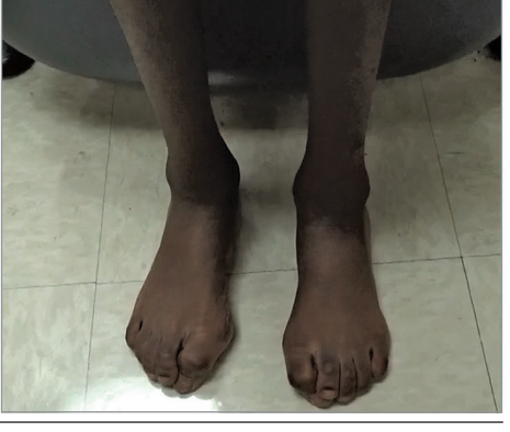
A and B, Tongue wasting and scapular winging in patient 2 carrying the p.Ala2OSer SPTLC1 variant. C and D, Tongue wasting and muscle atrophy of the lower limbs in patient 3 carrying the p.Ser331Tyr SPTLC1 variant. Note the hammertoe deformities of both feet.

mAD and Kaviar databases) as implemented in the Test Rare Variants With Public Data (TRAPD) software package version 1.0.14 The statistical significance threshold was set at a 1-tailed P value less than .05 for single-gene analysis and 2.5 \times 10<sup>-6</sup> for genome-wide significance (.05/20 000 genes).