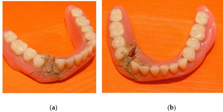
Figure 1. Prosthesis repaired by the patient: (a) lateral view; (b) frontal view.

the impression with the polysulfide, to perform the repair and reline both the lower and upper prostheses, as shown in Figure 3. The last phase, the delivery of the two prostheses and occlusal check, was performed on the same day, as shown in Figure 4.