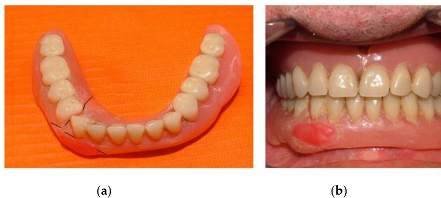
Figure 3. (a) Patient's prosthesis reassembly; (b) evaluation of the occlusion, in which the fracture of the upper prosthesis is noted.