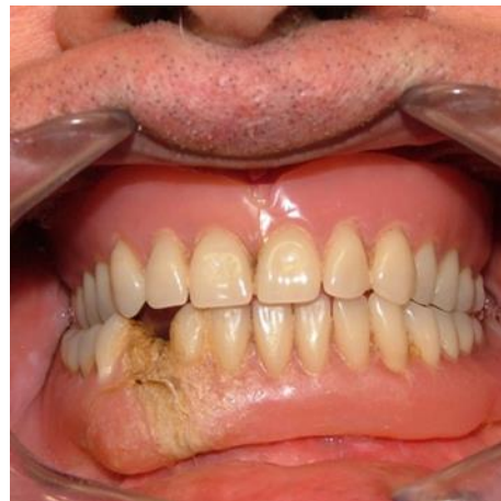
Figure 2. Intraoral view of the prosthesis repaired by the patient.