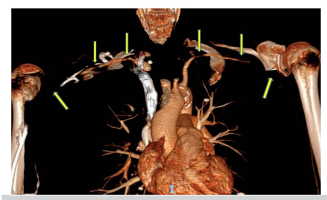
Fig 1. Three-dimensional reconstruction of arterial tree showing the narrowing of both subclavian arteries with significant focal stenosis ( yellow arrows ) and their occlusion in the distal segment, both axillary arteries occluded.

During the hospital stay, the patient was initially treated with high-dose corticosteroids and, in the face of a low response, with anti-interleukin-6 antibodies (Tocilizumab) administration for 1 month. This therapy improved headache symptoms without significant benefits on arm claudication. By mutual agreement, given the lesion extension and the arteries involved (Fig 1), revascularization was considered the second option. The patient, discharged with medical therapy (steroids, calcium