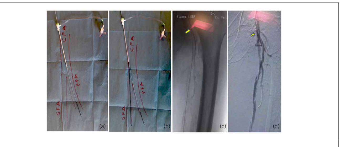
Figure 1 (a) Schematic combination of a 6-Fr sheath with a 4-Fr diagnostic catheter-guidewire positioned in the profunda femoris. (b) Introduction of the second 0.035-inch guidewire in parallel into the same sheath. (c) Retraction of the 6-Fr sheath over the bifurcation, arrow. (d) Puncture site, arrow. SFA: superficial femoral artery; PFA: profunda femoris artery; CFA: common femoral artery.

Conception and design: G.Z. Technique proposed by V.G. and performed routinely by G.Z. and LT Data collection: L.T. Writing the article: L.T. Critical revision of the article: L.T. Overall responsibility: V.G.