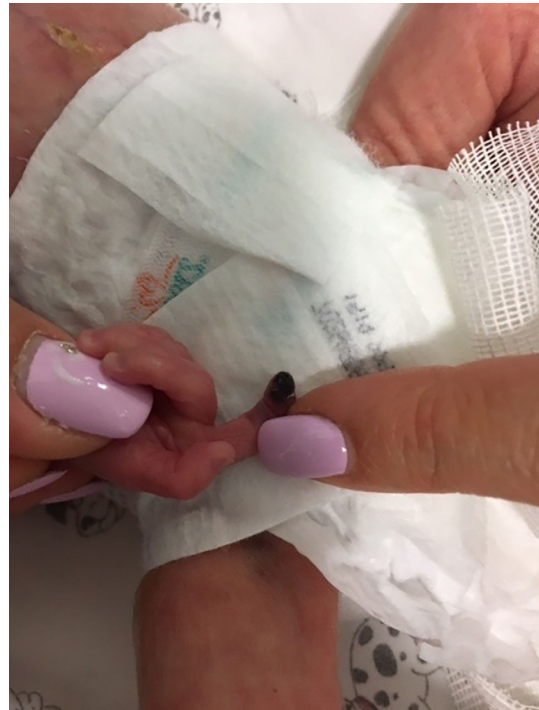
FIGURE 3 Ischemic lesion appearing in the index finger of the right hand of a 23 + 3 weeks newborn after arterial blood sampling

The third case was a 620 g-female infant. At 23 + 3 weeks of gestation, a placental abruption led to an emergency c-section. APGAR