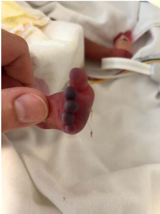
FIGURE 2 Ischemic lesions of the foot following cardiac arrest in a 27 weeks preterm twin

After 72 h, the improvement of lesions was evident and the resumption of pulses was confirmed at the color-doppler. At 96 h the affected limbs showed normal color, with total regression of the hypoperfusion.