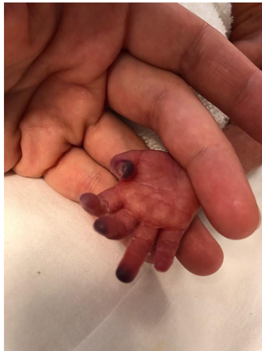
FIGURE 1 Ischemic lesions of the right hand fingertips following cardiac arrest in a 27 weeks preterm twin

Dorsalis pedis pulses were no more palpable; the radial pulses were weak. Doppler-ultrasound showed hypoperfusion, without thrombi. 2% NTG ointment was applied every 6 h.