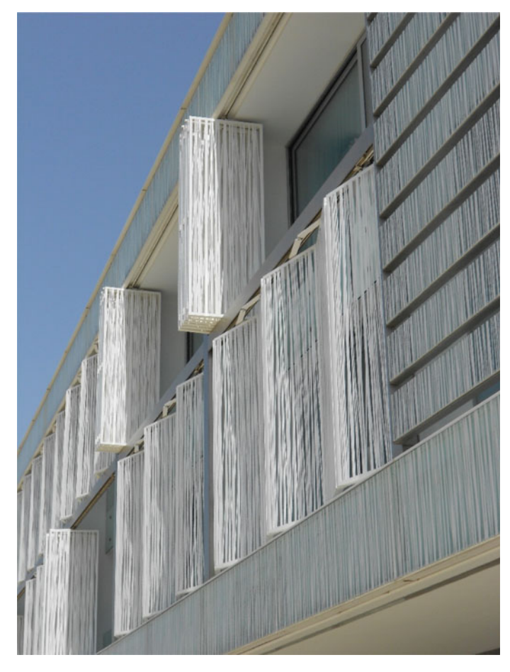
Fig. 26.3 Metallic louvers, office buildings in Lisbon.

materials and technologies equipped with smart functions in terms of purpose, operation mode, or adaptivity toward the external variations, considering also the relevant physics of the system or the adaptation scale (Loonen et al. 2013).