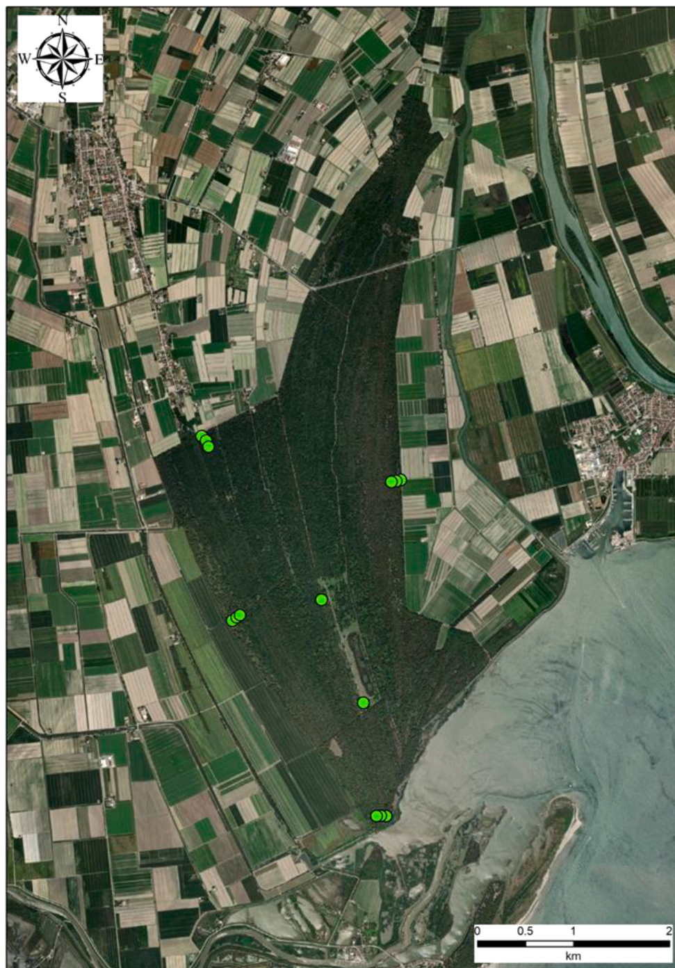
Fig. 2. Sampling points (four transects and two central points) for the measurement of leaf PM deposition in the Bosco Mesola Reserve. (Source: Esri - World Imagery Map, 2023).

PM_{10\text{leaf}} was experimentally measured with a sampling campaign carried out on 14th September 2021, thirteen days after the last rain event (2.8 mm, 31th August) as registered by the local weather station. To investigate possible differences among zones and potential edge