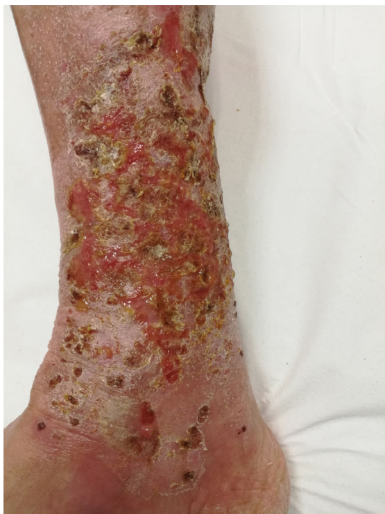
FIGURE 1 Blistering and erythematous-exudative dermatitis of the legs where the patient had repeatedly applied Tiobec ® cream.

positivity to \alpha -LA 5% petrolatum in all three patients; serial dilution of the substance gave a positive reaction down to a concentration of 0.025% in two out of three patients. 1 A further case of severe facial dermatitis caused an anti-ageing cream containing \alpha -LA and vitamin C was described in Belgium in 2016. Initially, patch tests were performed with the Belgian baseline series and the patient's cosmetic products 'as is', including the anti-wrinkle cream, which gave a clear positive reaction; upon further testing with all ingredients of the cream, a strong positivity to \alpha -LA 5% petrolatum was demonstrated. 2