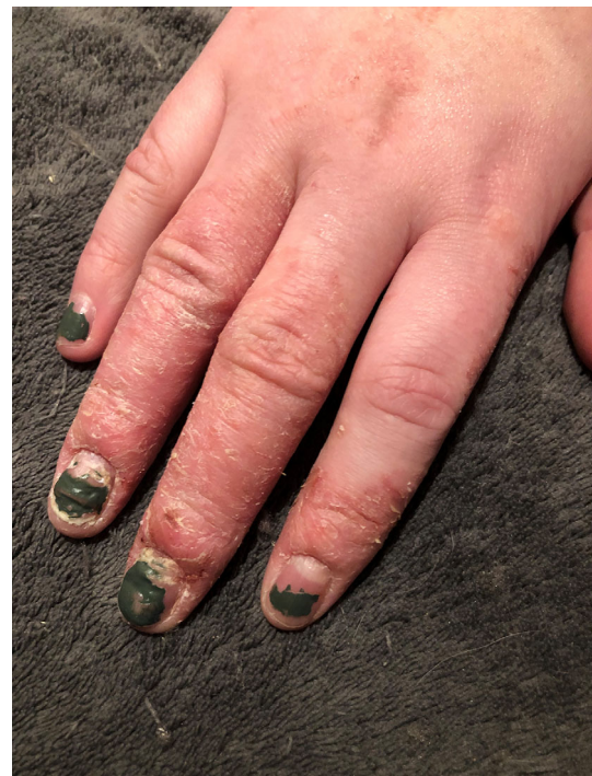
FIGURE 1 Severe pulpitis and nail dystrophy in a 13-year-old girl allergic to (meth)acrylates contained in a nail glue.

According to the ingredient list, the nail glue (Super Strong Nail glue from Depend Cosmetic AB ® ) contained several allergens: poly methyl methacrylate (MMA), poly ethylene glycol dimethacrylate (EGDMA), 2-bromo-2-nitropropane-1,3-diol/bronopol, 2-tert-butyl-