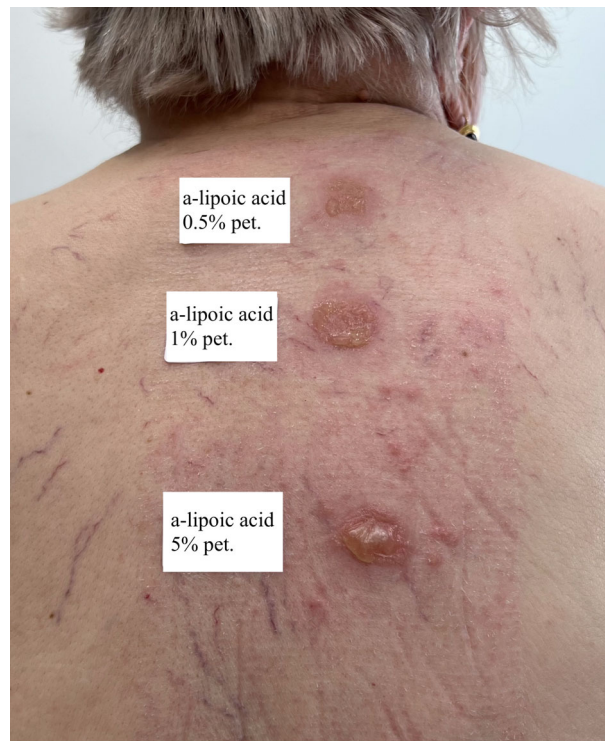
FIGURE 2 Strong positive reaction to \alpha -lipoic acid diluted, from top to bottom, in 0.5%, 1% and 5% petrolatum, at D3.

Performing patch tests with the patient's own products and their ingredients, may represent the key for identifying unusual relevant allergens.